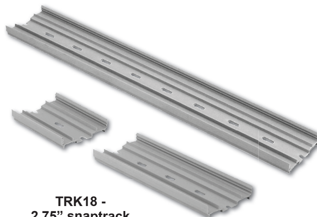
TRK18 - 2.75" snaptrack 18", 8" and 4" shown

The snaptrack cradles the ETA interface and communications backplanes and the terminal blocks, holding them firmly in place so you can build neat, accurate and cost effective control panels.