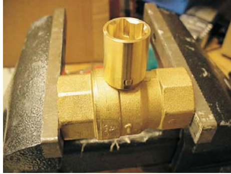
Mount collar to ball valve