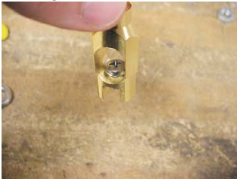
Insert mounting screw into locking stem