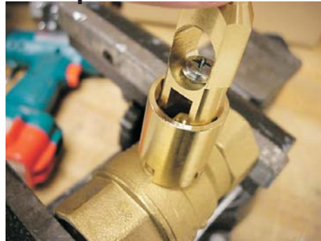
Mount locking stem into collar