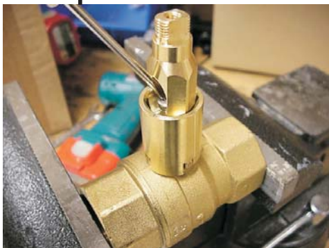
Tighten mounting screw