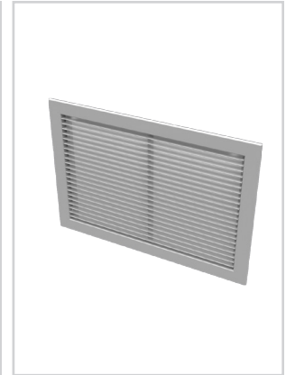
355 (ZRL / ZRS)