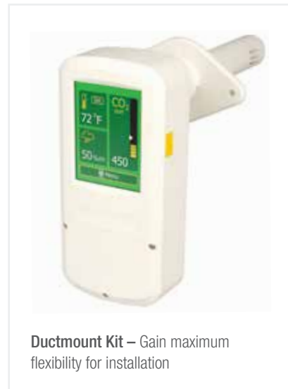
Ductmount Kit – Gain maximum flexibility for installation