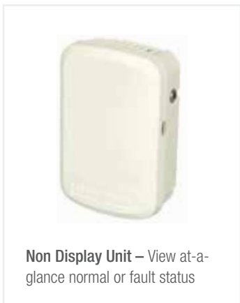
Non Display Unit – View at-a-glance normal or fault status

USB Port – Update display graphics with logo and contact information; allow future uploads of product enhancements