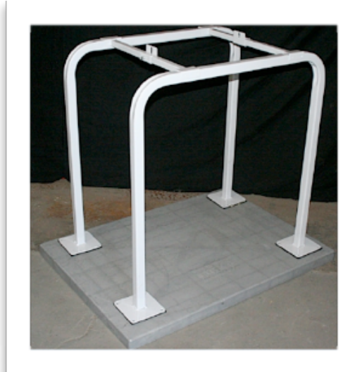
3' Condenser Heat Pump Stand SPECS QSHP36

Applicable for residential or light commercial installations